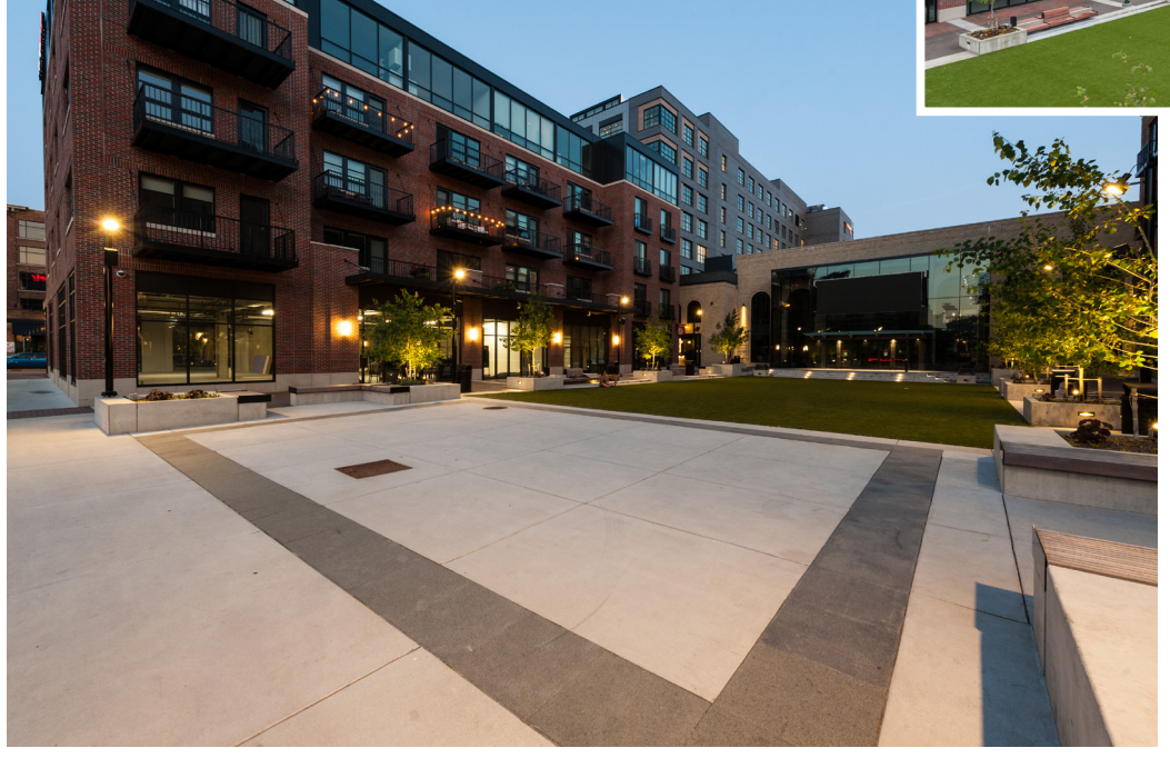
An outdoor piazza unifies the development and includes artificial grass, an outdoor movie screen, fireplaces, snowmelt sidewalks, comfortable seating and beautiful landscaping.