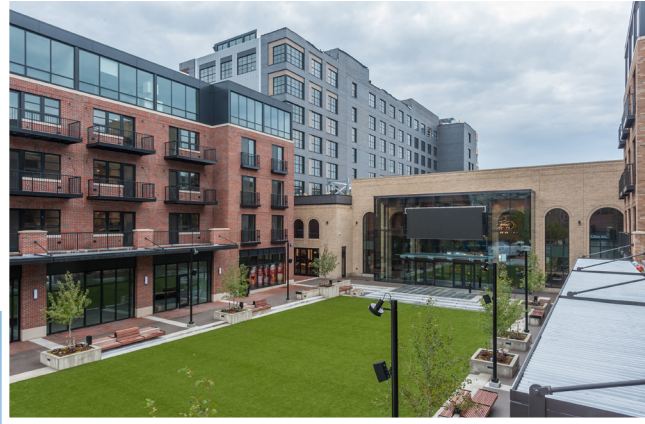
Where possible, floors two through four feature modern, private patios offering a more immersive experience for the residents and their visitors.