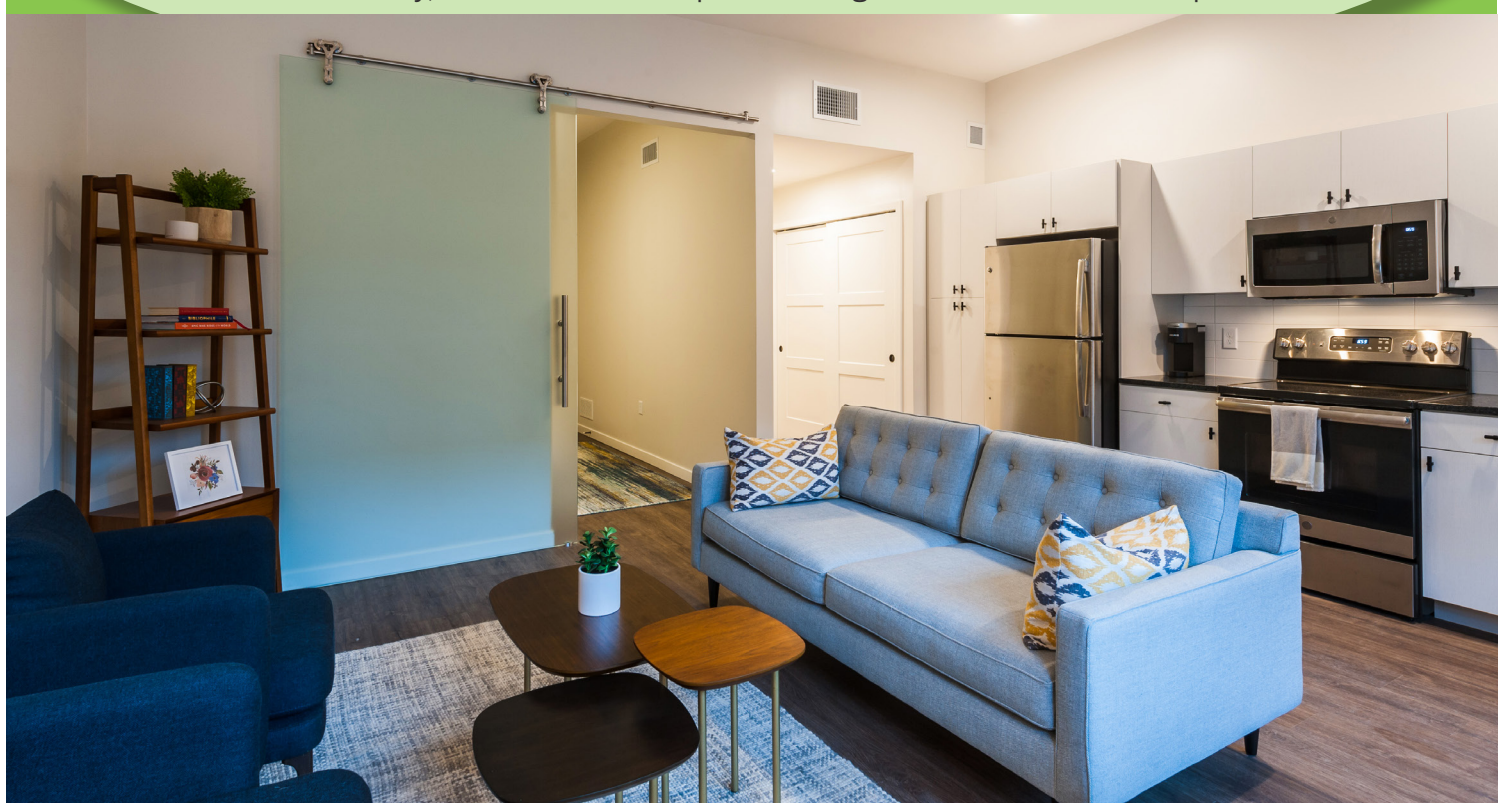
Each apartment includes modern, high-end features that align with the vision and design of the Studio Park development.

Multi-Family, Mixed-Use Development Brings New Life to Grand Rapids